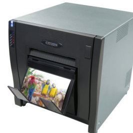
4x6 inch 'postcard' print with media catch tray