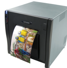
9x6 inch 'A5' print