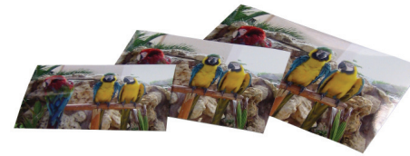
Examples of three media sizes of 4x6 inches, 5x7 inches and 6x9 inches